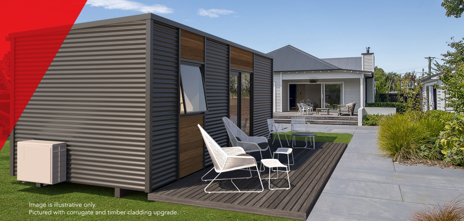
Image is illustrative only. Pictured with corrugate and timber cladding upgrade.