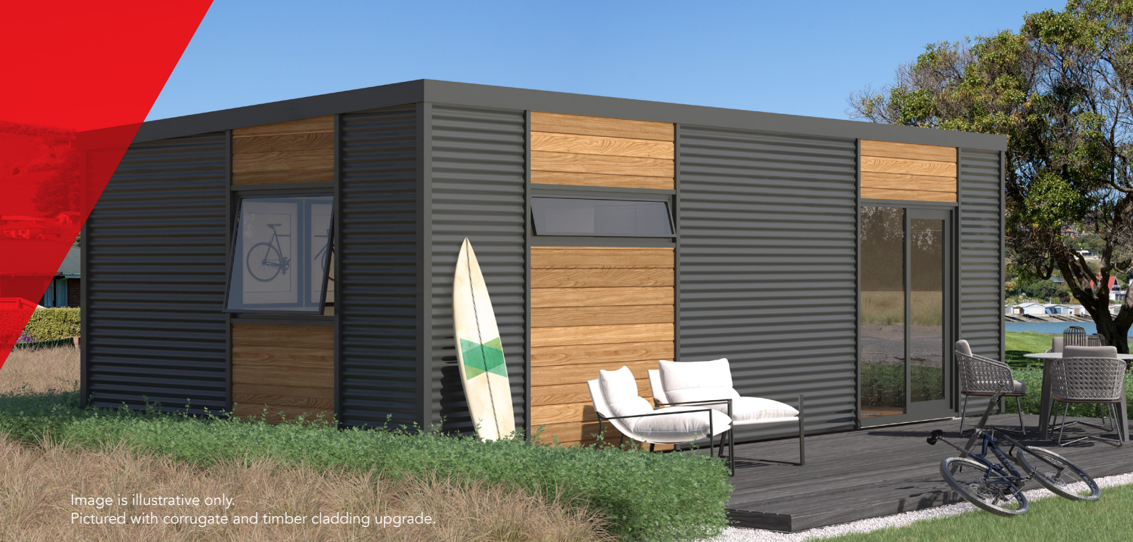
Image is illustrative only. Pictured with corrugate and timber cladding upgrade.